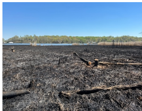
Photo above by Jeremy Castle, April 13, 2023. The water of the Severn River in the background is not usually visible at the Sanctuary because of the vegetation that is normally present.