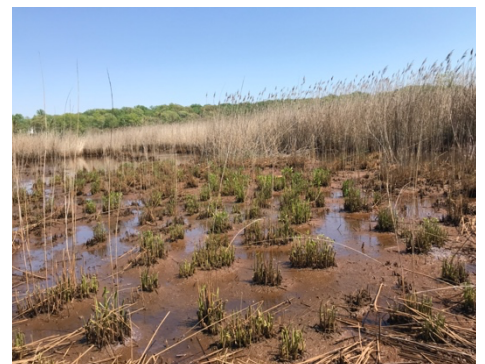
Photo above by Pat Brenner, April 21, 2023. Re-growth of vegetation, mostly Phragmites , is already apparent just nine days after the fire.