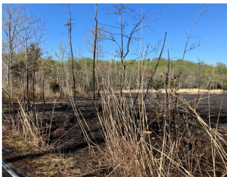
Photo above by Dominic Nucifora, April 12, 2023. Photo was taken shortly after the fire was brought under control.